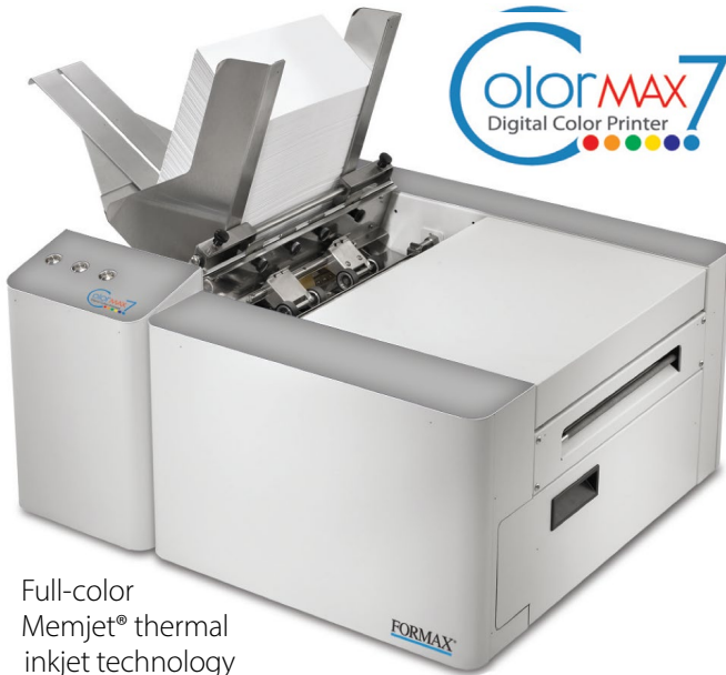
Full-color Memjet® thermal inkjet technology