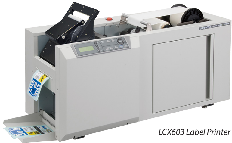
LCX603 Label Printer