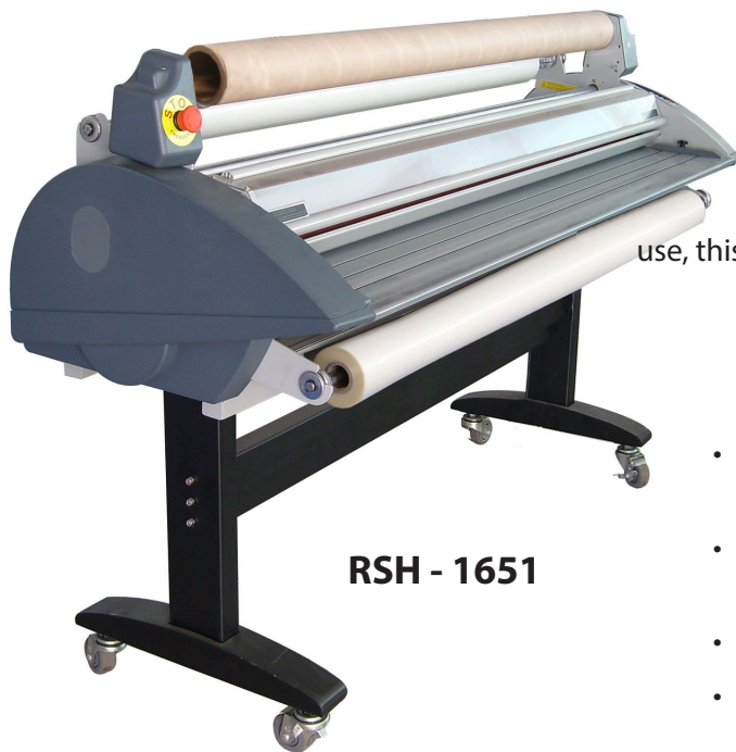
RSH - 1651