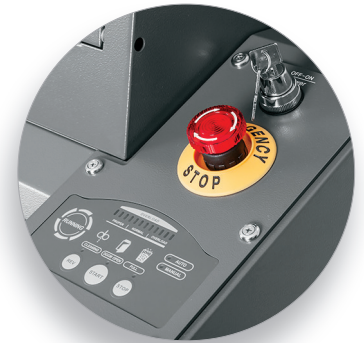
LED keypad with easy-to-use controls for simple operation.

The PowerTEC 909 HS Hopper Shredder is a high capacity machine for destroying sensitive information on paper and optical media. It features a powerful chain driven motor, an automatic EvenFlow Lubricator, and simple push button operation. This shredder is rated for Security Level P-3 destruction and holds up to 68 gallons of waste. It's precision engineered and guaranteed to provide many years of trouble-free operation.