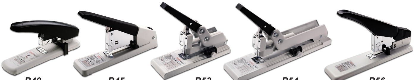
B40 Capacity - 100 sheets 10 1/2" x 2 3/4" x 5 3/4"

performance by providing even pressure on the staple legs until they clinch your documents. An automatic bypass system is standard on most models and provides the convenience of using larger staples on smaller projects.