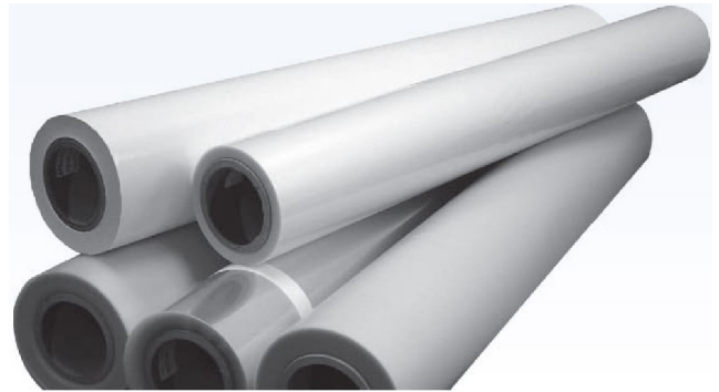
FINISHES: Gloss, Luster, Matte and Canvas.

Brilliance Pressure Sensitive Overlaminates provide a low-cost laminating solution suitable for indoor and outdoor applications. Brilliance laminating films contain UV inhibitors to reduce color shift caused by UV rays and are designed for short to medium term applications. These overlaminates are available in four standard finishes: Gloss, Luster, Matte and Canvas. Brilliance products feature a moisture-stable paper release liner and should be run with 120F heat assist for the clearest graphics possible.