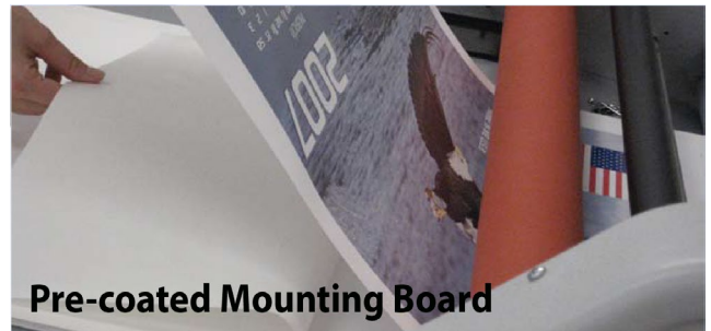
Pre-coated Mounting Board

Pressure Sensitive Mounting Adhesives are two-sided products designed to adhere graphics to other surfaces including foam boards, acrylic, floors, windows and more. Mounting Adhesives are available in a variety of types to meet nearly any mounting application. Choose a permanent mounting adhesive for durable rigid graphics or a removable mounting adhesive for temporary signage including floor and window graphics.