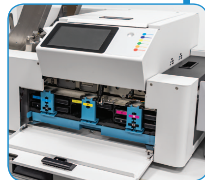
Clamshell design offers easy front access to ink tanks and paper path