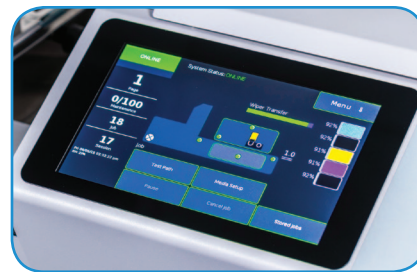
Intuitive 7" color touchscreen displays system status, image preview, and provides access to stored jobs