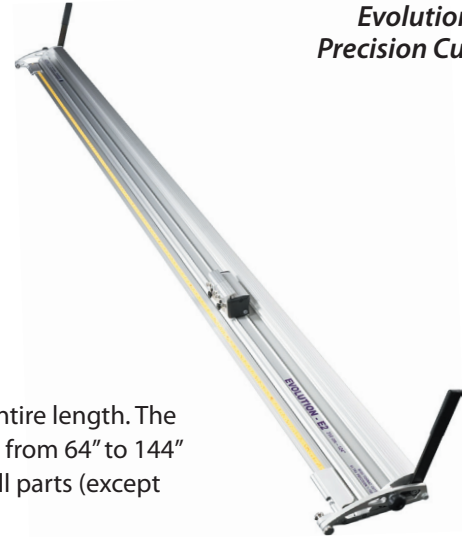
Evolution E2 Precision Cutter

The Evolution- E2 mounts directly onto your existing table or work surface. Adjustable levelers ensure straight and accurate cuts to within .008" over the entire length. The lift hold mechanism is operable from both sides. Available in five practical sizes from 64" to 144" and is backed by Foster Keencut's unprecedented 5 year general warranty on all parts (except blades) and a 20 year warranty on the bearings used in the cutting head.