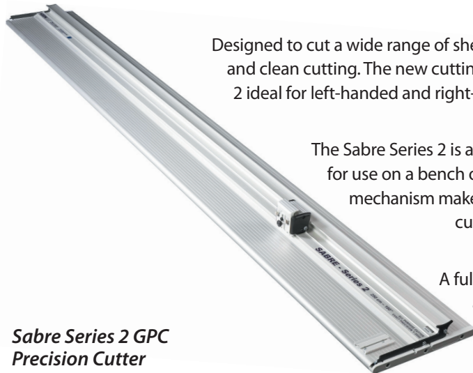
Sabre Series 2 GPC Precision Cutter

A full length silicon rubber grip strip mounted in the surface of the base and two more on the underside of the cutter bar ensures all work is held perfectly in place while cutting and provides protection for even the most sensitive surfaces. bearings used in the cutting head.