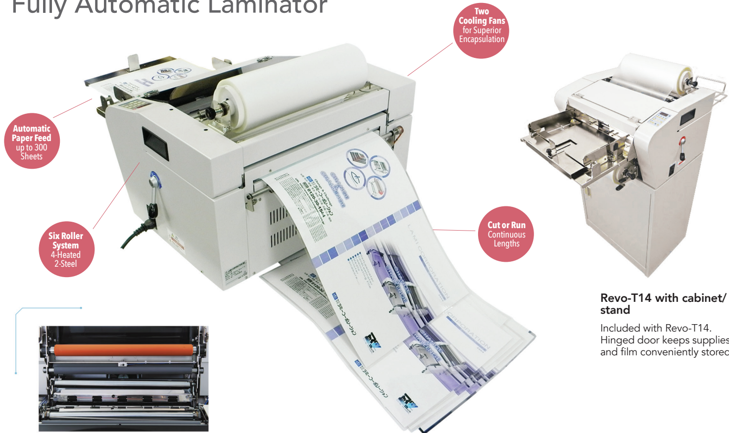
Revo-T14 with cabinet/stand

Included with Revo-T14. Hinged door keeps supplies and film conveniently stored.