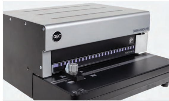
Redesigned metal cover