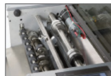
Rotary Action Creasing Assembly