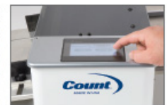
Touch Screen Controller