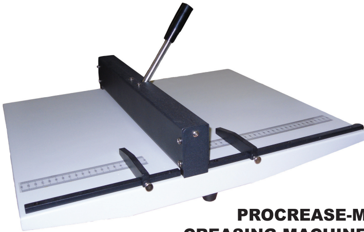
PROCREASE-M CREASING MACHINE